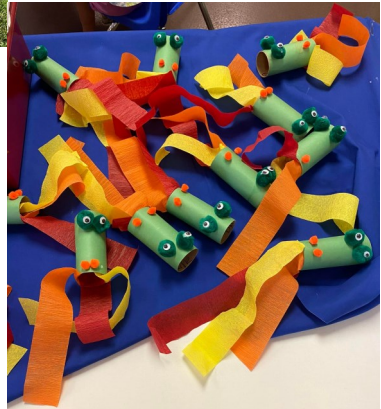
Fire Breathing Dragons!