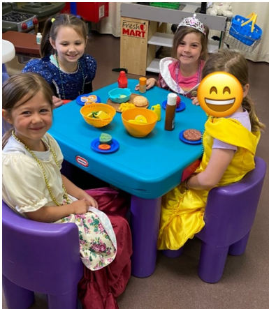
Some of our Little Princesses enjoying Royal Tea