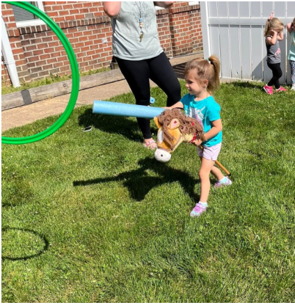
Here is one of our friends “Jousting”

Happy Summer! JNP is busy this summer with two summer camps. Our first camp, in June, was the Knight's & Princess Camp. The children had a blast learning what it was like to live like royalty!