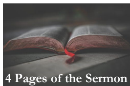
4 Pages of the Sermon

The online Bible Study, “The Four Pages of the Sermon” will continue to meet over the summer months. Weekly on Wednesdays, please join this study of the upcoming weekend’s texts. The study begins at 6:30 pm, and the Zoom link is posted on Zion’s Facebook Page.