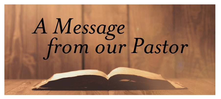
Give thanks to the Lord, for He is good; for God's mercy endures forever. 1 Chronicles 16:34